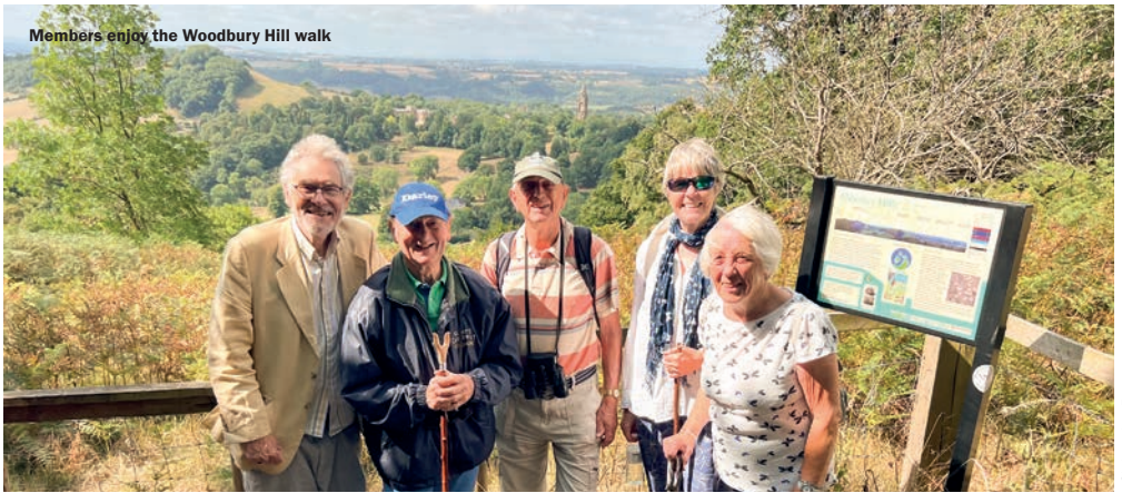
Members enjoy the Woodbury Hill walk