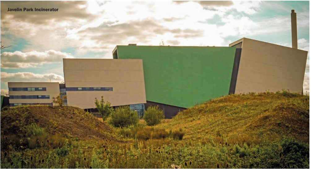
Javelin Park Incinerator