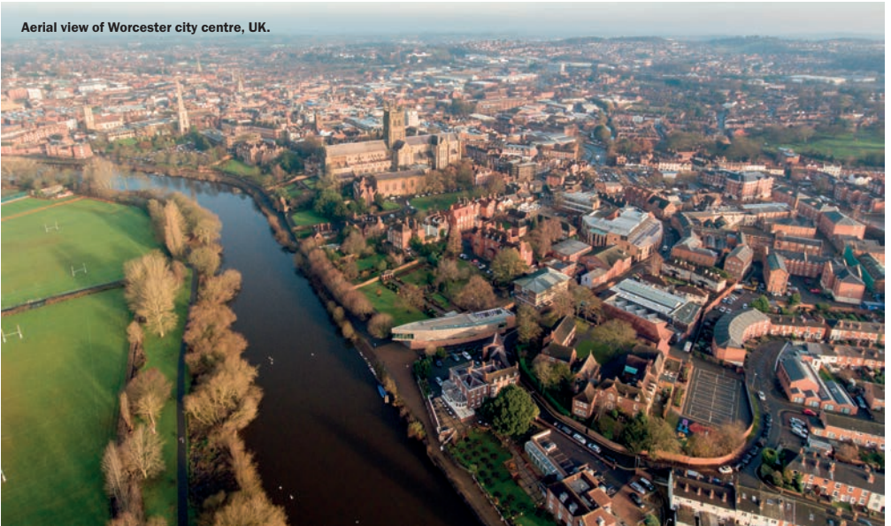
Aerial view of Worcester city centre, UK.

This is another chance to hear January's cancelled talk. The presenters have kindly rescheduled and we look forward to hearing how, in their heyday, Worcester's thriving industries depended on the River Severn and its neighbouring canals.