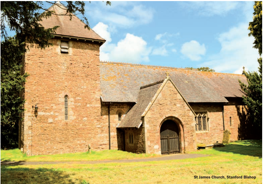
St James Church, Stanford Bishop

Learn about the emergence and history of this important women's Volunteer Corps and how it has developed through two world wars and continues to deploy specialist rapid response teams to support civil and military authorities in times of crisis.