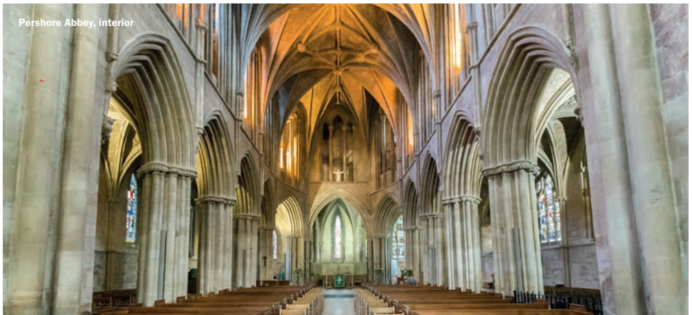
Pershore Abbey, interior

Address: Lower Interfields, Malvern, WR14 1UU.