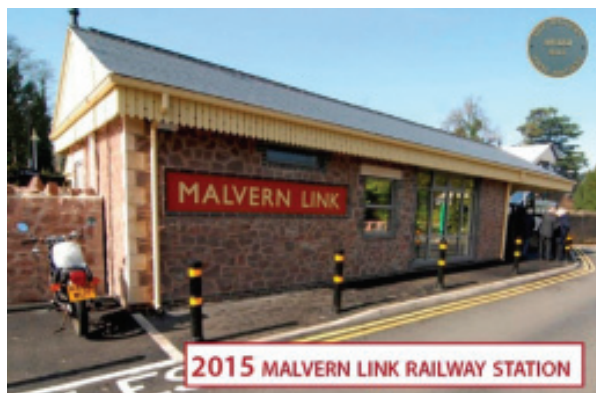
2015 MALVERN LINK RAILWAY STATION