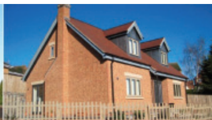
2017 HIGHLY COMMENDED — NO.366 PICKERSLEIGH ROAD (ABOVE) AND COPPER BEECHES, ALBERT ROAD SOUTH (BELOW)