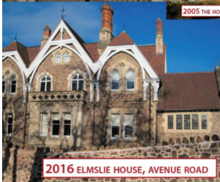
2016 ELMSLIE HOUSE, AVENUE ROAD