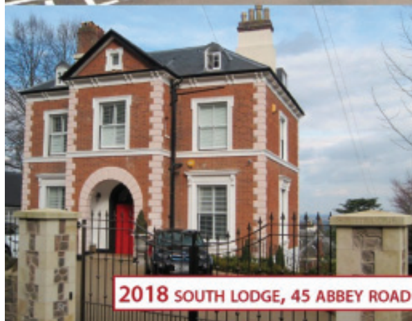
2018 SOUTH LODGE, 45 ABBEY ROAD