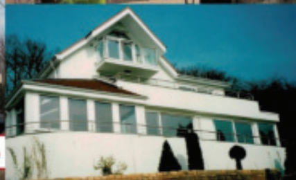
2005 THE HOOD, BROCKHILL ROAD, WEST MALVERN