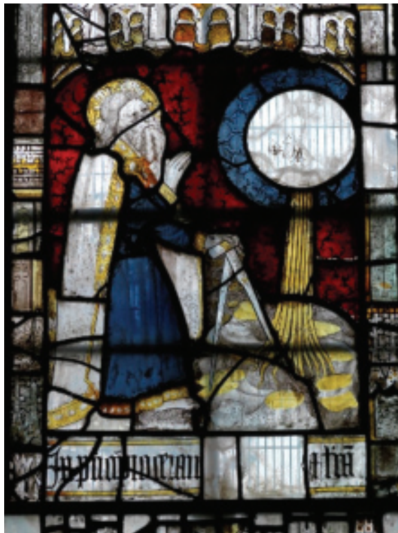
St Anne's Chapel Appeal, Great Malvern Priory

The theme of the week is ' Edible England ' and a number of local farms are hosting visits; it is hop picking time.