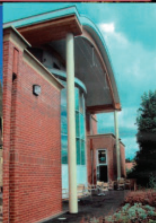
2007 RENOVATION OF MALVERN LIBRARY, GRAHAM ROAD