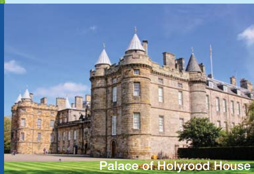
Palace of Holyrood House

View and share this tour online - click on View Your Tour at www.tailored-travel.co.uk and quote wmnt212