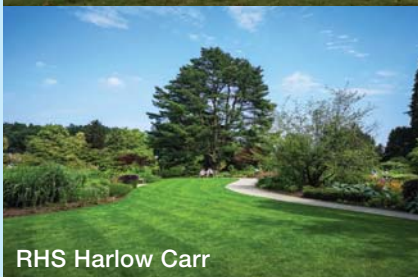
RHS Harlow Carr

6 days from £649 Departing 11 October 2021