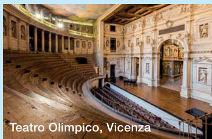
Teatro Olimpico, Vicenza