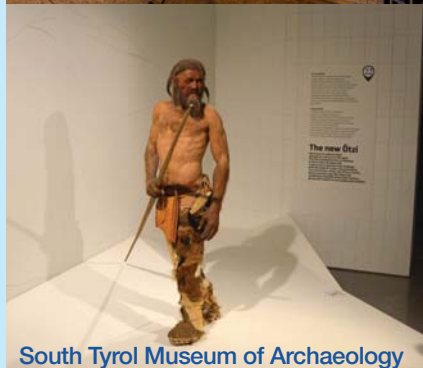
South Tyrol Museum of Archaeology