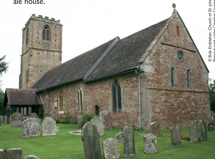
© Bob Embleton, Church of St John the Baptist, Mathon. Reproduced under Creative Commons license.

Twelfth-century church located in small medieval core to the west of Colwall Stone. Stump of old preaching cross in churchyard. Early sixteenth-century timber-framed church ale house.