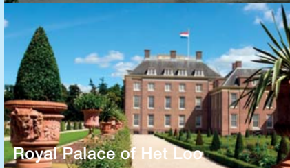
Royal Palace of Het Loo